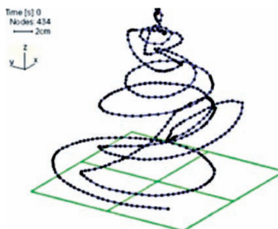
Fig. 1. Computer simulation of the electrospinning process. The fiber, represented as a chain of elementary charges drawn by the electric field towards the collecting electrode, exhibits a looping trajectory with an accelerating amplitude of deviations

Electrospinning is based on the complex hydrodynamic and electrostatic interactions of charges moving at a rate of several meters per second in an electrostatically driven bending liquid jet of rapidly changing physical properties (elongation, solvent evaporation, crystallization). The nanofiber dynamics research that was first launched at the Institute of Fundamental Technological Research, Polish Academy of Sciences, back in 2003 was initially focused on process control. This led to the development of a computer model enabling selective analysis of the parameters crucial for the stability of the electrospinning process and fiber draw ratio (see Fig. 1). Experimental investigations have confirmed some of the correlations anticipated by the model. The impact of the physical properties of the polymer solution used and the electrical field applied on nanofiber formation was evaluated. However, it