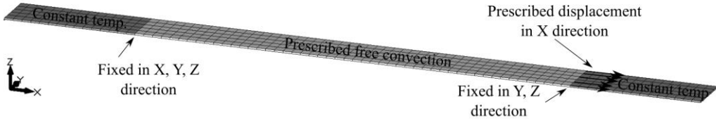
Fig. 1. Finite element mesh with loading and boundary conditions (Dunić et al. 2014)