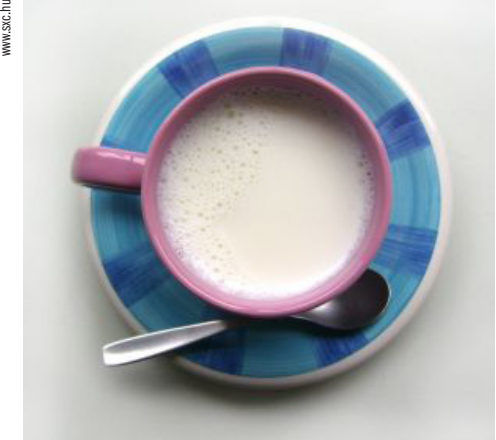
Colloid particles occur in nature, for example in milk

Where does the water near the hydrophobic plate originate from? The hydrophobic plate powerfully attracts the organic substance, but the charge on the plate has a powerful attraction to ions. However, the ions cannot penetrate the organic substance. There is competition for access to the plate among components that cannot occur next to one another, not unlike hostile tribes fighting for prime riverside territory. A compromise is achieved by the plate attracting ions, together with the water molecules that surround them. The whole "packet" of ions and water