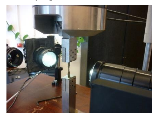
Fig. 1. Photograph of experimental set-up used for investigation of deformation and thermal fields

The setup [Fig. 1] consists of MTS 858 TM and two cameras working in two different spectral ranges: visible (0.3-1 \eta m) Manta G-125B and IR (3-5 \eta m) ThermaCam Phoenix. Dog bone sample with sizes 100 x 8 x 0.5 mm were used, gauge part 7 x 4; length of virtual extensometer for DIC - 7 mm. More experimental data for investigation of effects of thermomechanical couplings in Gum Metal under tensile loading is presented in [3].