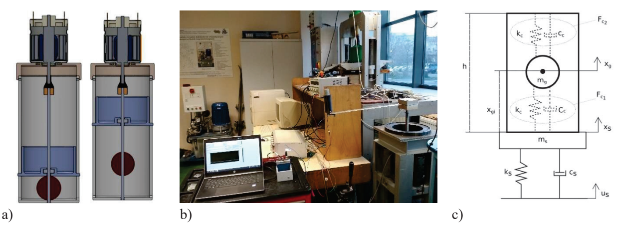
Fig. 1 a) ATPID model, b) Experimental test stand, c) Scheme of the ATPID construction

The conducted research consists of experimental and numerical part. The experimental part concerns construction and prototype of the proposed ATPID damper (Fig. 1a). The specially designed test stand (Fig. 1b) allows to study response of the beam vibration under harmonic excitation of a wide frequency range.