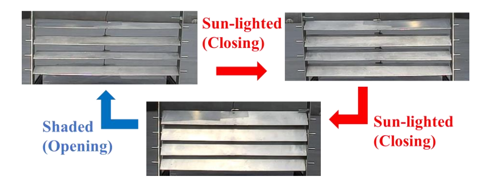
Fig. 5 Photograph of opened and closed states of solar-powered blind