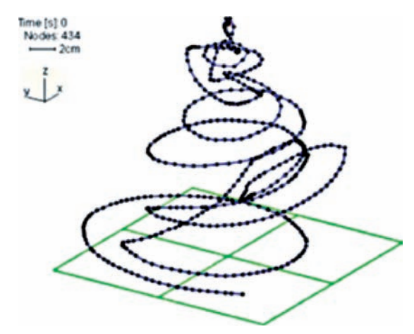
Fig. 1. Computer simulation of the electrospinning process. The fiber, represented as a chain of elementary charges drawn by the electric field towards the collecting electrode, exhibits a looping trajectory with an accelerating amplitude of deviations

Electrospinning is based on the complex hydrodynamic and electrostatic interactions of charges moving at a rate of several meters per second in an electrostatically driven bending liquid jet of rapidly changing physical properties (elongation, solvent evaporation, crystallization). The nanofiber dynamics research that was first launched at the Institute of Fundamental Technological Research, Polish Academy of Sciences, back in 2003 was initially focused on process control. This led to the development of a computer model enabling selective analysis of the parameters crucial for the stability of the electrospinning process and fiber draw ratio (see Fig. 1). Experimental investigations have confirmed some of the correlations anticipated by the model. The impact of the physical properties of the polymer solution used and the electrical field applied on nanofiber formation was evaluated. However, it