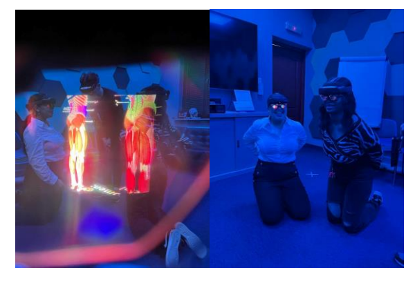
Figure 3. Medical students during the MR-based anatomy courses with the application of the HoloLens 2, supported by the Erasmus + MR AME project [109].

Moreover, it is known that children were one of the groups most affected by social distancing during the COVID-19 pandemic. To make it easier for children to adapt to remote education, they were offered the use of an MR-based solution in the form of a game [108]. Thus, MR-based solutions can also promote socialization in the event of forced lockdowns.